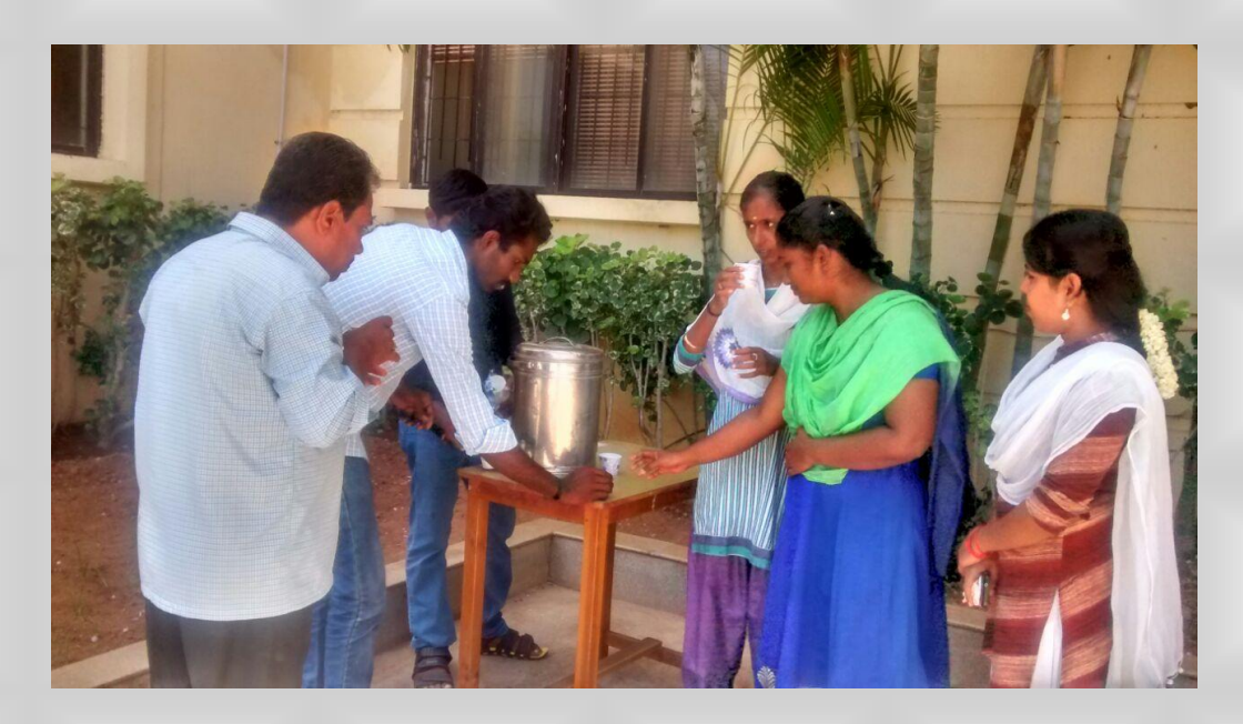
Nilavembu kudineer: A siddha drink boosting Immunity

Department of Computer Science, Alagappa University has organized two days International Workshop on "Data Science and Analytics" during 27-28th September 2016. 205 candidates including students, research scholars and computer science teachers have participated.