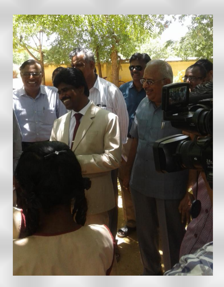
Honourable Vice –Chancellor Interacting with Students in the VPP Camp