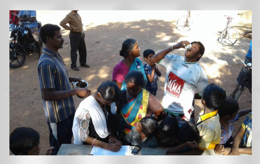
Nila Vembu Kudineer Valanguthal

campaign for educating children etc. Since the village has no facilities for girls[98] to stay at Thiruvelankudi, the students were taken to Ona Siruvayal for their food and stay. Further, the students cleaned the temple in and around at Ona Siruvayal as one of the tasks in the programme. The VPP programme has finished at the most satisfaction of the villagers. All the staff members of the Department participated in the programme.