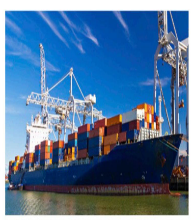
Five big-picture trends are critical to improving the performance of the maritime industry over the next decade.

Five evolving trends are influencing the global maritime industry, according to a new report from IHS Maritime and Trade.