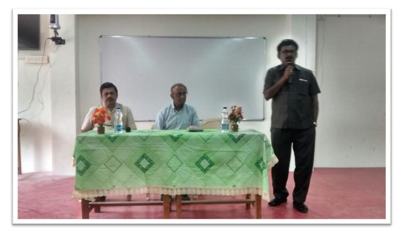
One Day Workshop - February 16, 2017