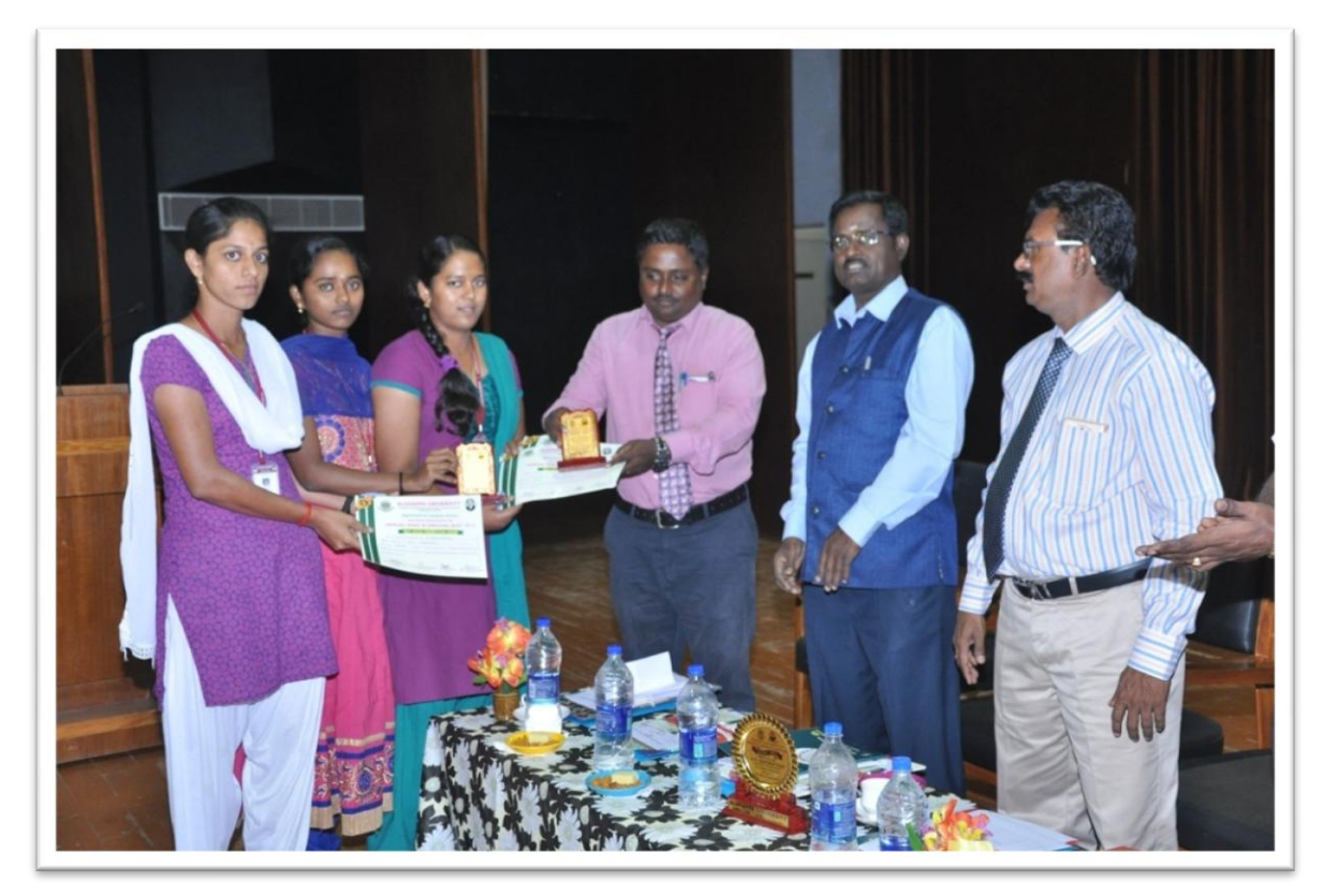
Participants receiving certificates and best paper award in NCETC 2017