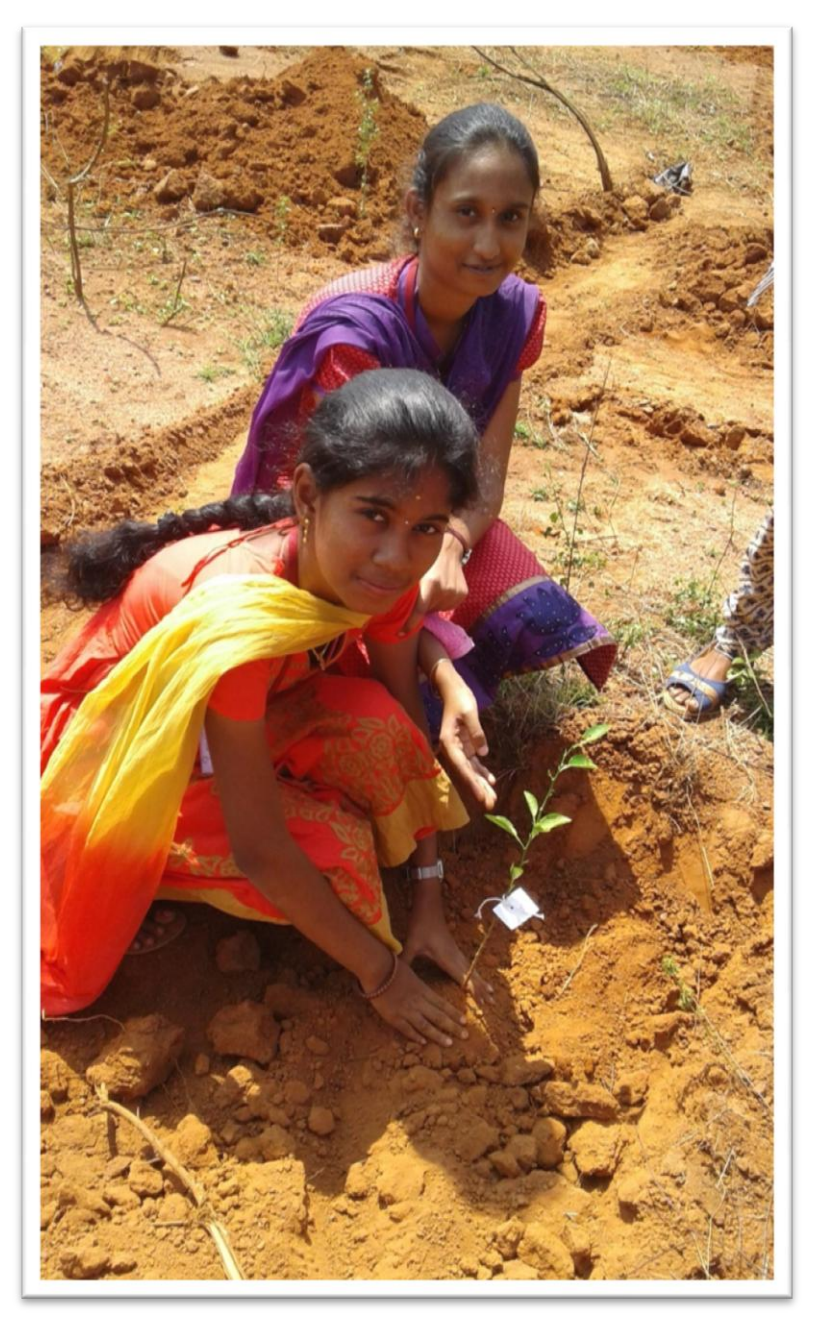
Centre for Swatch Bharath, Swash Bharath, NSS Environment Awareness Club and Department of Botany jointly organized the programme. Tree saplings were planted in front of Management Studies Campus by First Year M.Sc. Students of Department of Computer Science.

One Student One Tree Programme organized by Swatch Bharath and Swash Bharath Centres – February 10, 2017, 10:00 a.m.