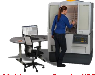
Multipurpose Powder XRD